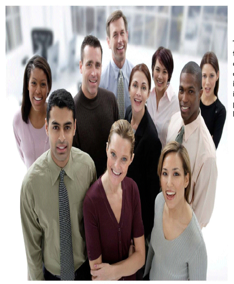
Honor a Colleague...

Online Graduate Certificate and Masters of Professional Studies in Applied Demography. The Department of Sociology at Pennsylvania State University will launch online courses leading to a Graduate Certificate and a Masters of Professional Studies (MPS) in Applied Demography in the Fall of 2016. These courses are offered through Penn State's World Campus. These programs are designed for working professionals who are seeking to increase their knowledge of applied demographic topics and methods, to enhance their careers, support organizational goals and objectives, and better understand and anticipate population change. The opportunities for applied demographers are numerous and include: data and market research analysis, local, state and regional planning, and consulting for public and private organizations. The Certificate is a 12-credit (four courses) program that provides an introduction to the concepts, measures, data, software, and methods used in applied demography with an emphasis on applications in both the public and private sectors. The four courses in the Certificate form the core requirements for the online MPS in Applied Demography. The online MPS in Applied Demography is a 30-credit degree (10 courses) and will draw on applied demographic research from both the U.S. and international contexts. Students will complete their MPS with a capstone project where they will apply the applied demography perspective to a subject relevant to their professional